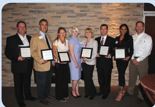
Founding Partners in Distinction members receive their inaugural certificates at the first networking mixer.

Thank you to our founding Partners in Distinction!